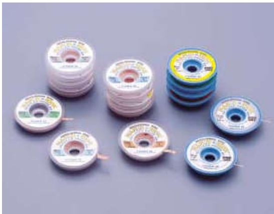
Removal for thru-hole...